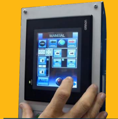
All settings available on touch screen control panel