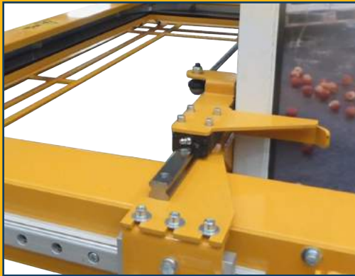
CRC Technology for a perfect placement of corners