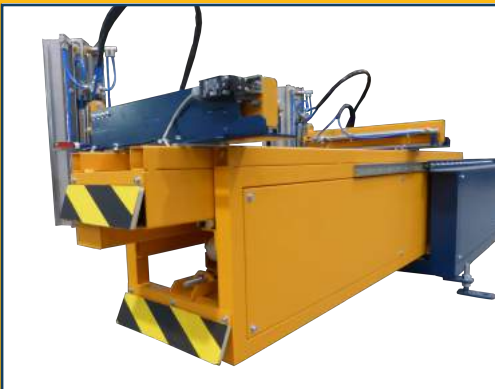
Automatic corner placer with pallet size detection