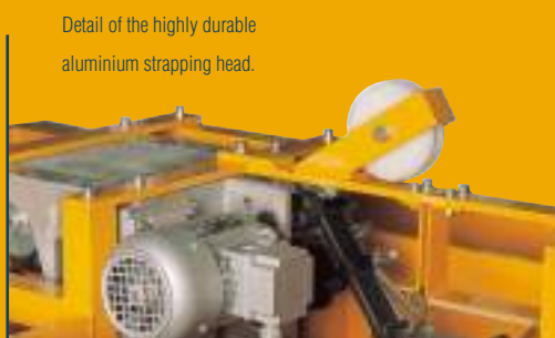
Detail of the highly durable aluminium strapping head.