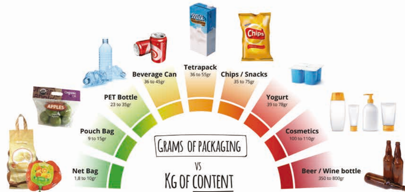
This chart shows the weight of different types of packaging needed to contain 1 kg of product. In each type the usual range of values is indicated, taking into account that the packaging size and possible variants can significantly affect the weight of the pack to contain 1 kg of product.

For more than 50 years, Giró has been committed to the environment, sustainable development and recycling. The unique breathability and visibility of the net bag not only makes product attractive, it is an extremely light package made with 100% recyclable materials. Giró net packaging systems has the best content/material ratio in the fast moving goods industry making them the most sustainable in the horticultural market.